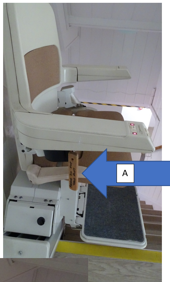
Chair in rotated position with safety belt stowed.